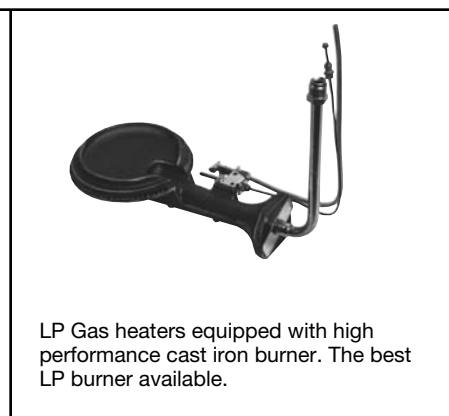
LP Gas heaters equipped with high performance cast iron burner. The best LP burner available.

NEW LOW CONSUMPTION PILOT USES LESS B.T.U.'S